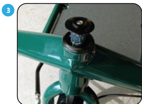
3 Screw in the expander/top cap using your strong hand!