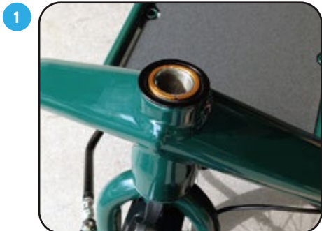
1 Insert bearings, fork and then compression ring