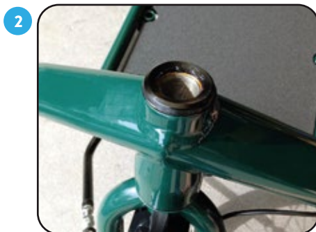
2 Place top cover