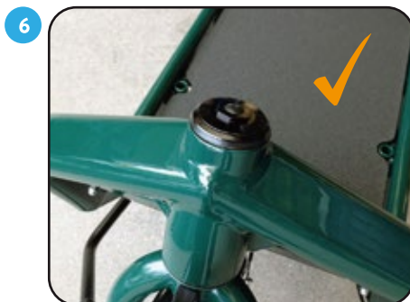
6 You have now successfully installed your new headset!