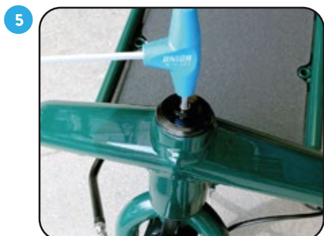
5 Finish by tightening the expander using a 5mm allen key