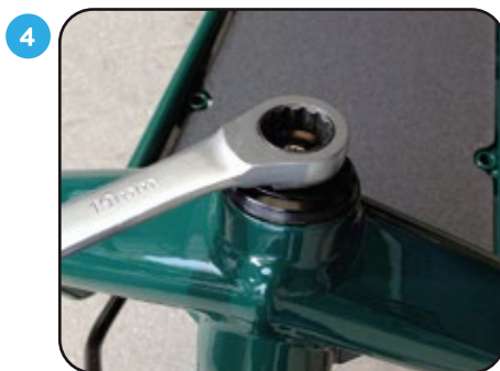
4 Lightly tighten with a 19mm spanner